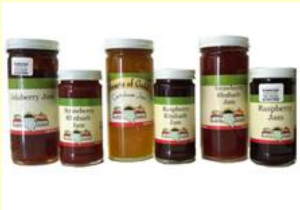
Jams comes in 4 oz or 8 oz sizes

You can order the jams online at www.lattinfarms.com or calling us at 866-638-6293.